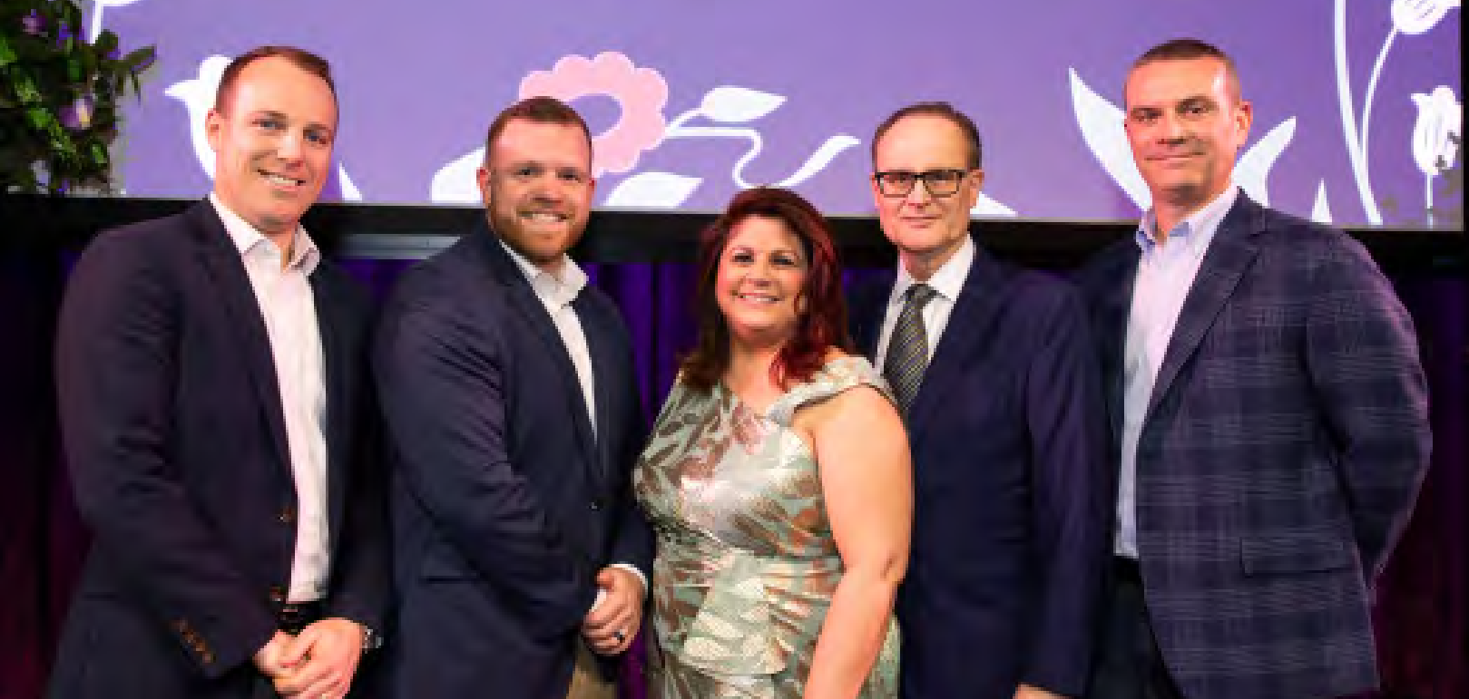
SERVICE CU IMPACT FOUNDATION BOARD OF DIRECTORS

Since its inception in 2020, the Impact Foundation has raised more than $4 million through its annual golf tournament, annual gala, employee donations and cash raffle. Every dollar donated directly supports education, housing, veterans and first responders.