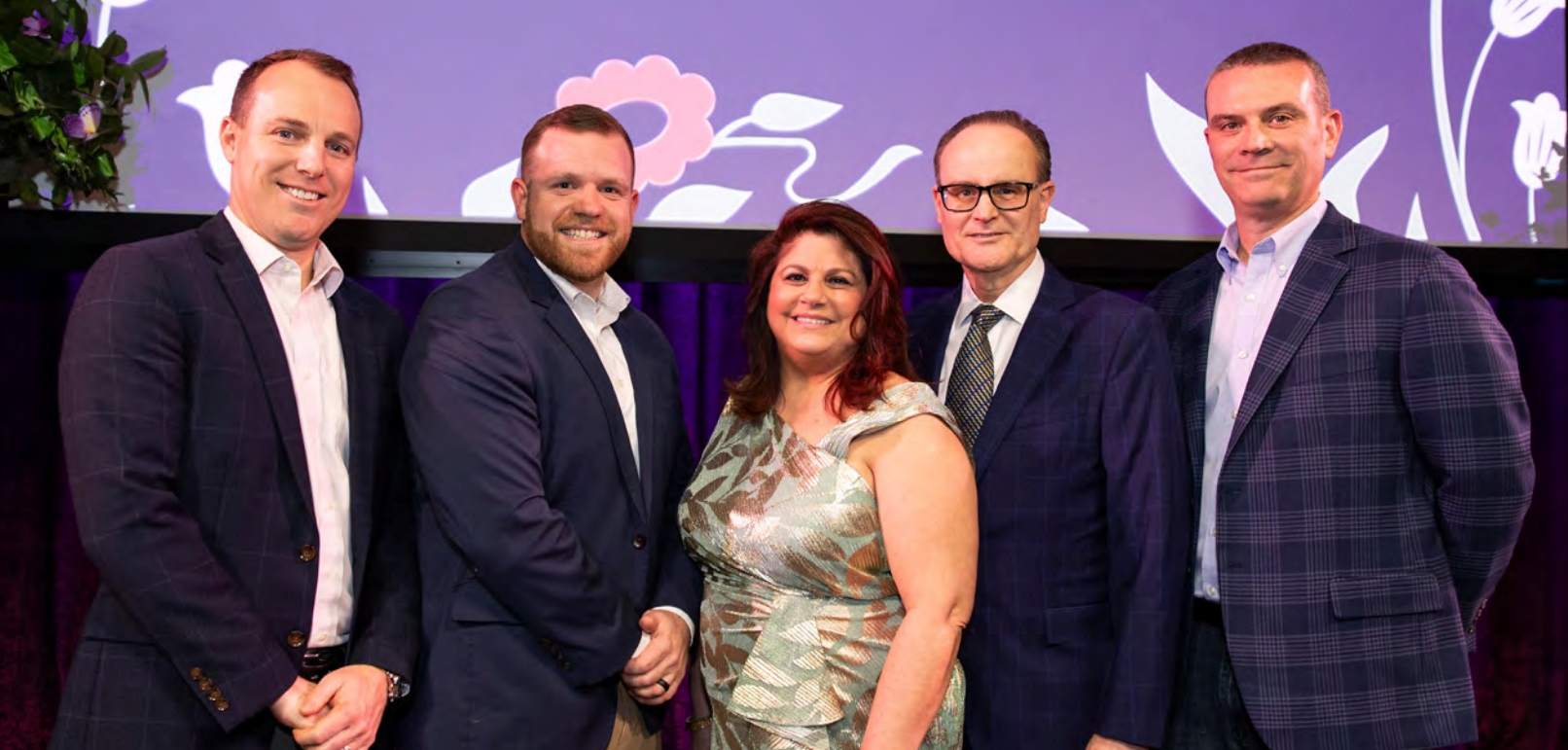
SERVICE CU IMPACT FOUNDATION BOARD OF DIRECTORS

Since its inception in 2020, the Impact Foundation has raised more than $4 million through its annual golf tournament, annual gala, employee donations and cash raffle. Every dollar donated directly supports education, housing, veterans and first responders.